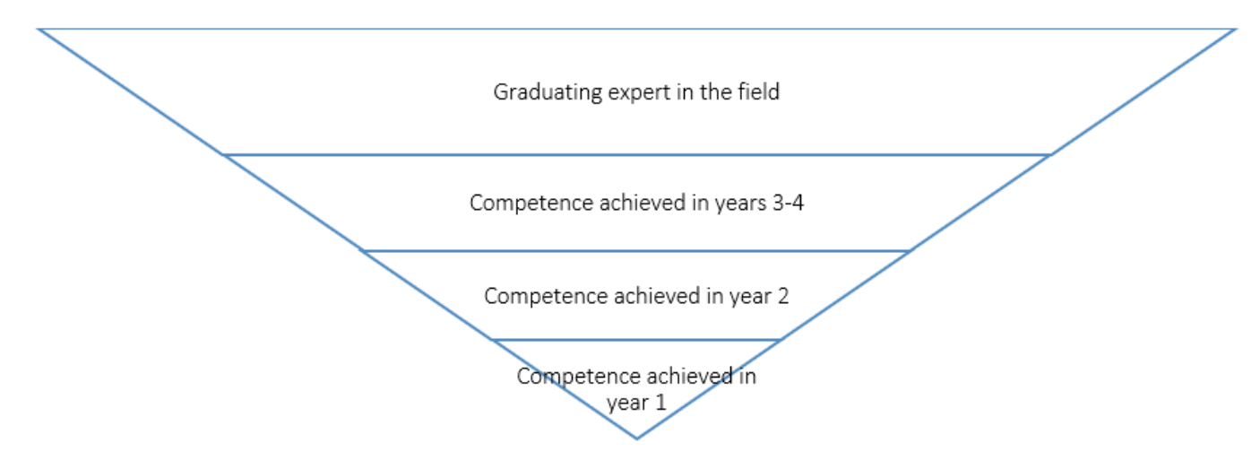
Figure 2. Accumulation of competence

As the studies progress, competence is accumulated so that the learning outcomes set for the degree programme are achieved upon graduation, both in terms of the common competence and the degree-specific, expert core competence (Figure 2).