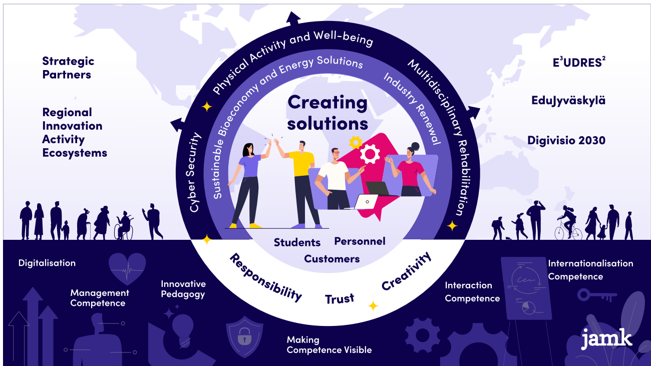
Image: Creating Solutions, a vision for Reinventing Higher Education